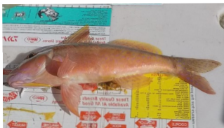
Goatfish and weedy whiting